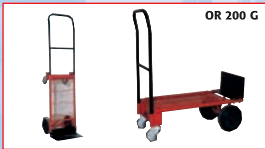
OR 200 G