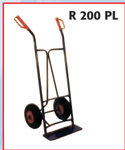
R 200 PL